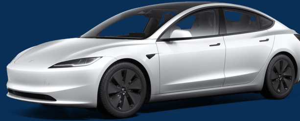
Tesla Model 3 Saloon RWD 4Dr Auto