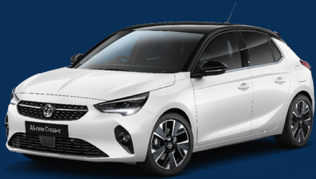
Vauxhall Corsa-e Electric Hatchback 100kW GS Line 50kWh 5Dr Auto