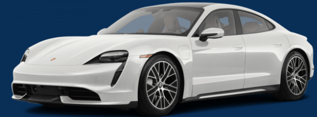
Porsche Taycan Saloon 300kW 89kWh 4Dr Auto